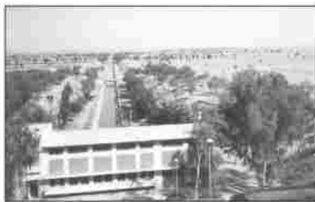
Fig. 6.5 : Indira Gandhi Canal and its adjoining areas

Indira Gandhi Canal, previously known as the Rajasthan Canal, is one of the largest canal systems in India. Conceived by Kanwar Sain in 1948, the canal project was launched on 31 March, 1958. The canal originates at Harike barrage in Punjab and runs parallel to Pakistan border at an average distance of 40 km in Thar Desert (Marusthali) of Rajasthan. The total planned length of the system is 9,060 km catering to the irrigation needs of a total culturable command area of 19.63 lakh hectares. Out of the total command area, about 70 per cent was envisaged to be irrigated by flow system and the rest by lift system. The construction work of the canal system has been carried out through two stages. The command area of Stage-I lies in Ganganagar, Hanumangarh and northern part of Bikaner districts. It has a gently undulating topography and its culturable command area is 5.53 lakh hectares. The command area of Stage-II is spread over Bikaner, Jaisalmer, Barmer, Jodhpur, Nagaur and Churu districts covering culturable command area of 14.10 lakh ha. It comprises desert land dotted with shifting sand dunes and temperature soaring to 50°C in summers. In the lift canal, the water is lifted up to make it to flow