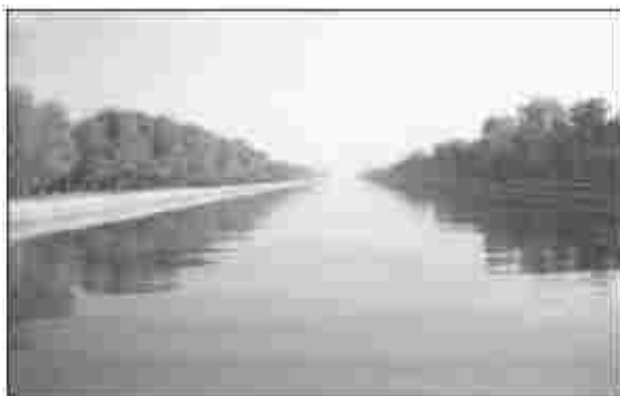
Fig. 6.4: Indira Gandhi Canal

for conservation of resources to enable the future generations to use these resources. It takes into account the development of whole human kind which have common future.